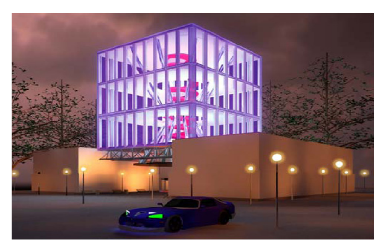
Figure 1. A view at the sc-fi museum in accordance with the suggested new conception (S. M. Gordeeva)a

process of perception of the power of thought, regarding thought as a value. It will help to better understand the variety of possibilities, to find a new look at the common things, and to be thrilled by the power of creativity and happiness of inspiration.