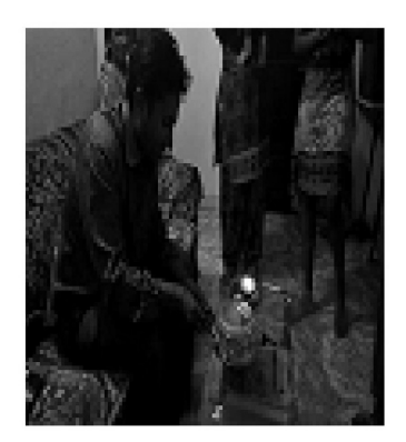
Figure 3. Result by Fibonacci Sample Selection

White rectangle show how noise are introduced sequentialy.