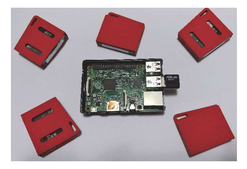
Figure 1. Raspberry Pi 2 with the SensorTag CC2650 nodes

For monitoring the air temperature has been used SensorTag CC 2650, show in Figure 1, and it will operate under the Bluetooth Low Energy mode that is the default firmware for the sensor nodes. This sensor nodehas ten low power consumption sensors: ambient light sensor, altimeter/pressure sensor, humidity sensor, 9 - axis motion sensor, IR thermophile temperature sensor, magnet sensor and microphone [2].