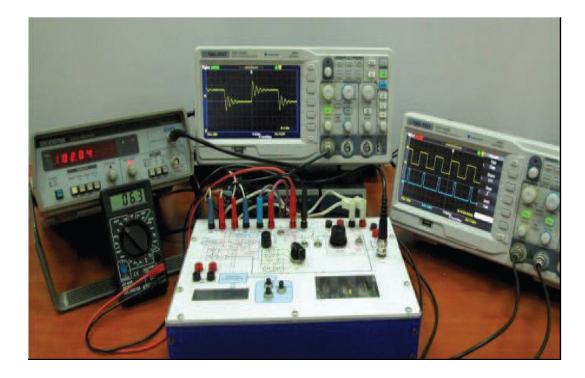
Figure 2. The proposed kit in use (at the moment of taking the photo, the variable resistor in the loop filter is not adjusted to its optimal value

The next task is to determine the synthesized frequency range of the synthesizer, provided that the VCO FRF by design is 100 MHz for example, which under normal operating conditions can change within a certain range, e. g. \pm 1 MHz. Based on the findings in the previous task, the students should be able to deduce what the worst conditions for the synthesis of the minimum and maximum frequencies are. Then, after setting the corresponding VCO FRFs they should pick out experimentally the minimum and maximum N values, for which the in-lock condition is still maintained. For the minimum and maximum synthesized frequencies, the corresponding control voltages should also be written down in the lab record. Then the students should propose ways for modifying (widening/narrowing and translation up/down) the synthesized frequency range of a PLL synthesizer.