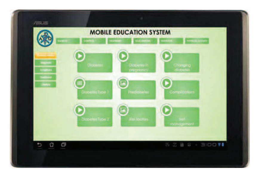
Figure 2. User interface with categories, subcategories and elements

In addition, it is possible to completely control the video content. To view the textual content, txt and html files are used.