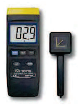
Figure 1. Measuring device Lutron EMF-828 with separate probe

Magnetic field measurement is performed by EMF measuring device Lutron EMF-828 with separate probe, including sensing head. Fig. 1 shows the measuring device Lutron EMF-828 with its probe.