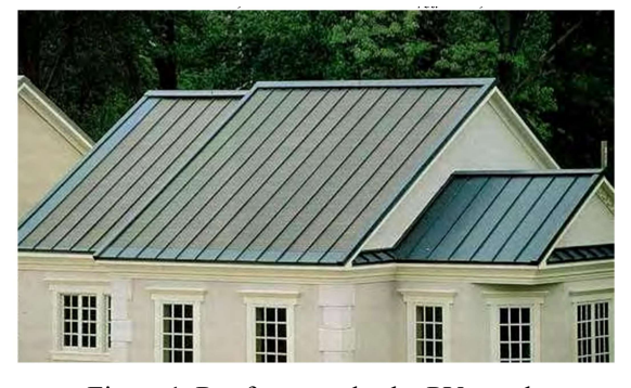
Figure 1. Roof mounted solar PV panels

After the calculation, the value of the K_{red} is 0,65.