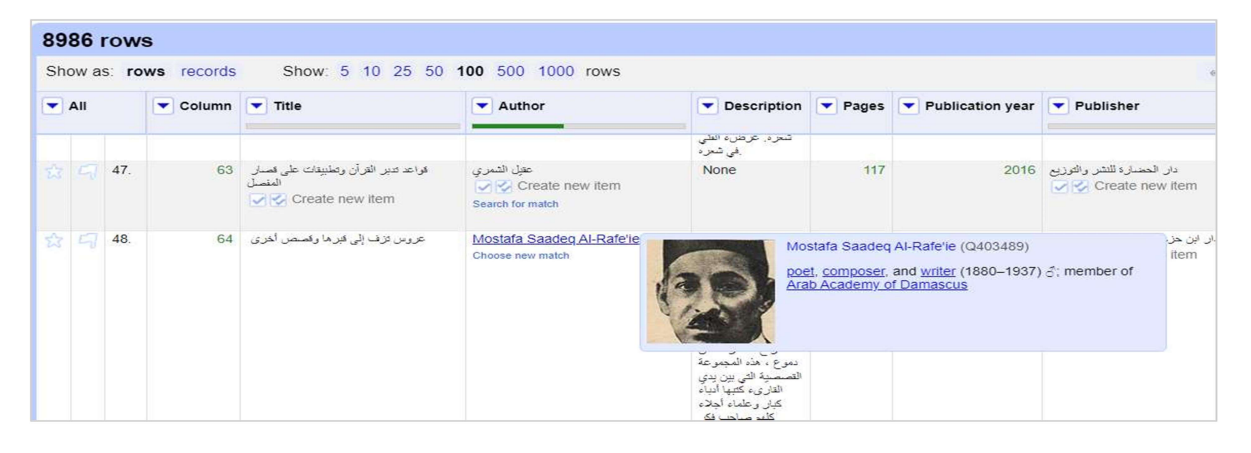
Figure 3. Using Openrefine reconciliation service for authors names with Wikidata service

In the application we used the triple store as a union catalog so we could query about books of the other libraries using SPARQL and we can import the retrieved results and modify them then save them in our local database, which saves a lot of time for the librarians as shown in figure 5.