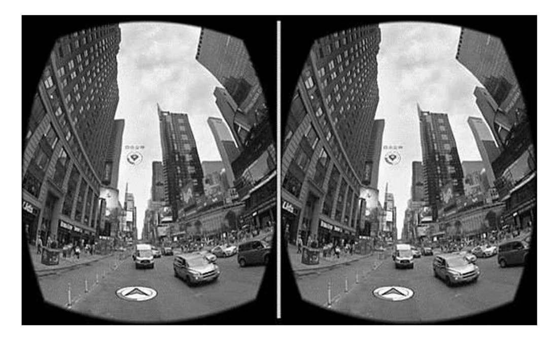
Figure 4. Oculus dk2 dual view

virtual roaming, using a combination of automatic roaming and autonomous roaming; when the experimenter is unfamiliar with the related work scene auto-roaming, those who want to make their progress on the story of the progress of the rover can be autonomous, can get a better view of the width, high flexibility, through the WASD keys around the move, the mouse or headset can convert roaming perspective.