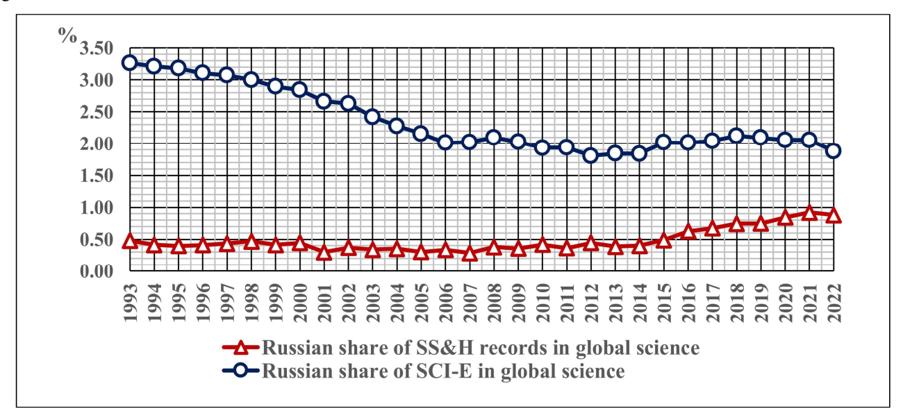
Figure 1. Trends on Russian share of research productivity in both databases: Social Science Citation Index and Art & Humanities Citation Index, and Science Citation Index-Expanded in global science

On the other hand, the share of Russian documents in SCI-E experienced a decline from 3.2% in 1993 to 1.9% in 2014. However, slow growth has been observed afterwards, with the share rising to 2.4% in 2020 in global science. These data are presented in Figure 1.