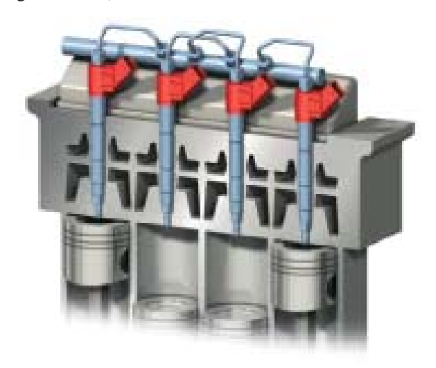
Figure 1. Electrification monitoring applications

the whole process of the work, also can realize the operation of equipment through a computer monitor system in the current monitoring system of power plant. Now standard electrical automation software provides a graphical editor, the engineering and technical personnel can use the editor by easily drawing the monitor screen, and realize the function of data display and remote operation. Therefore, as the system function is the most intuitive and vividly expressed, the system show the end user operation platform, graphics creating, editing and display fully which embodies the advanced nature of the system, ease of use, and use humanized design concept (see figure 1 and 2).