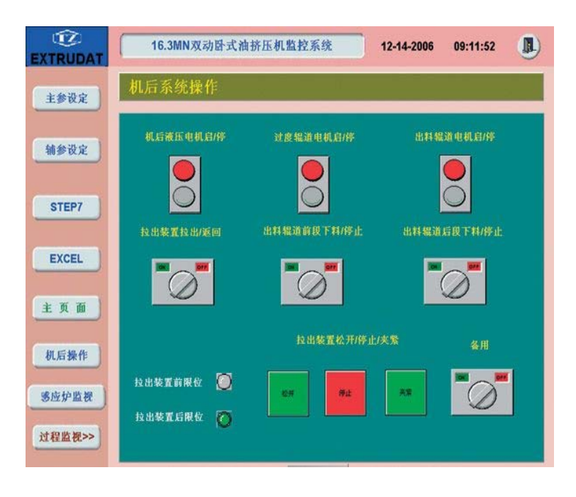
Figure 2. Machinery electrical control system (Chinese version)

In this paper, the graph editor is a non-real time online sub module used for electrical automation monitoring system, which is responsible for the creation and editing of power equipment model, wiring diagram[1], data diagram and other resources. Currently used to draw power system wiring diagram of the graphical tools, the common relationship between the following graphics and database processing has not found a good solution, or graphics; and there is no contact between the database used to calculate or not closely linked and mutual communication is thus difficult. Most of the graphics are relatively independent, graphics editing is complex and inconvenient to modify. Graphics storage mostly adopts the method of file or two-