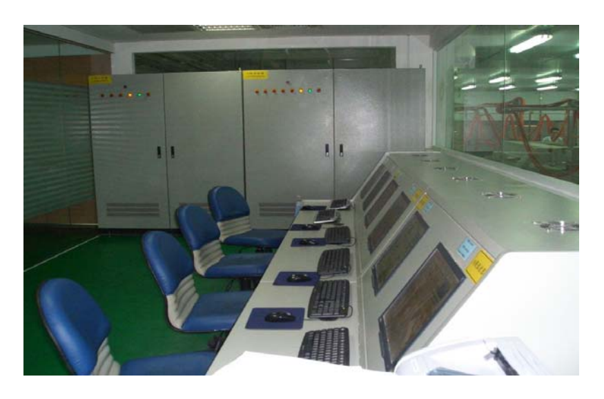
Figure 6. Electrical automation control equipment (b)