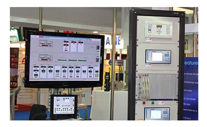
Figure 5. Electrical automation control equipment

In this paper, the development of graphic editing tools to ECS (electric automation control system) system and the system unified electric automation control integration platform based on using hierarchical modular and components design idea, is studied and it is found to have high reliability, scalability, ease of maintenance and open. Through a variety of means of communication for convenient access to the different manufacturers of protection and control device and the user's existing automation device, it can realize a plant with comprehensive functions of electricity in the low-voltage electrical system protection, measurement, control and analysis. At the same time, DCS, SIS and other systems would provide the external data interface, and a more rich electrical testing data, to achieve the resources between different systems or data. This requires that the system provides a friendly support for the establishment of original data input, model, thus greatly reduces the difficulty and workload of the original data input, and the system with the input data detection tool, greatly improve the accuracy of data entry. So the graphics editor needs to achieve the following functions (see figure 5 and 6).