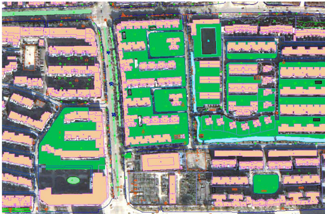
Figure 4. Map Overlaid by Figure 2 and Figure 3

maps, the boundary contour of urban residential areas are used as the range of R_{min} . In the last, through Table 3 and Figure 1, the optimal spatial resolution of images is further confirmed in the range of 0.4-0.8m.