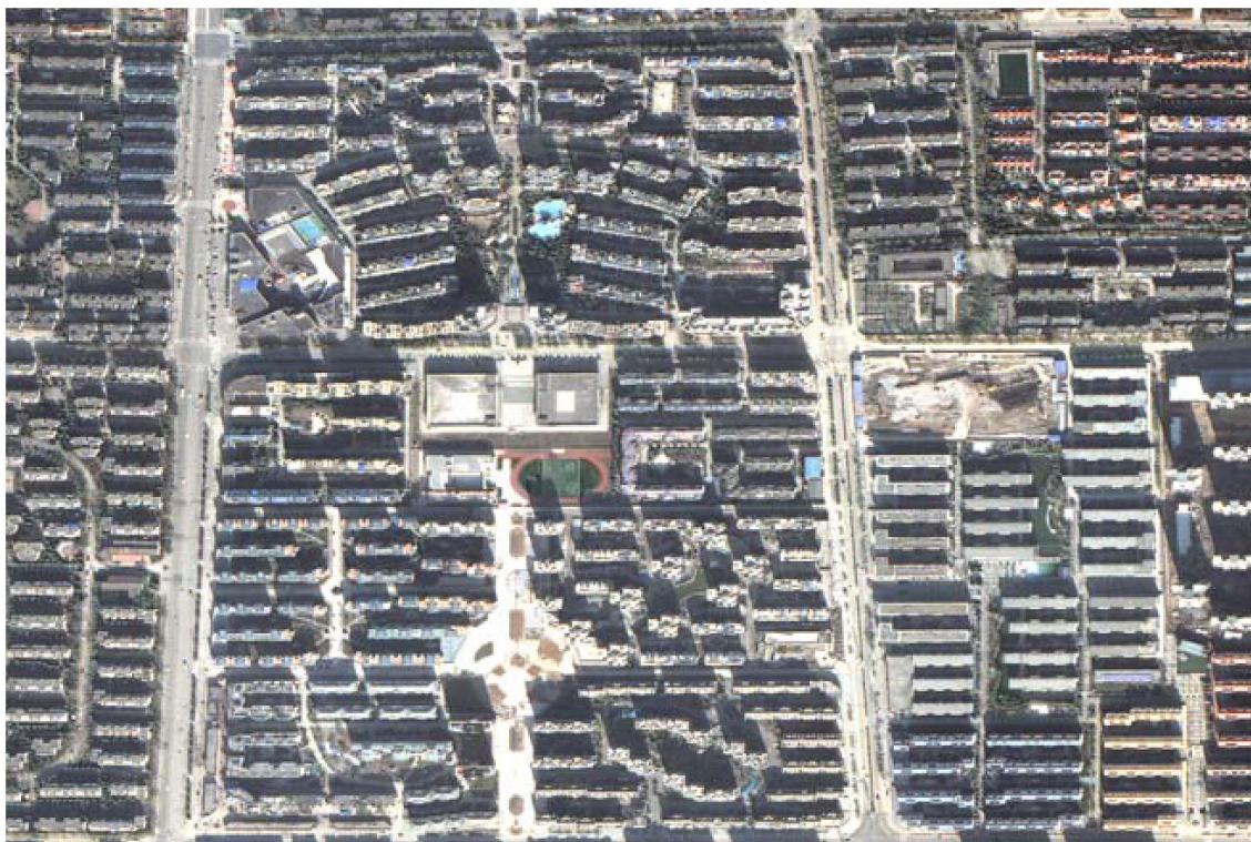
Figure 2. Quick-bird satellite images with the spatial resolution 0.61m