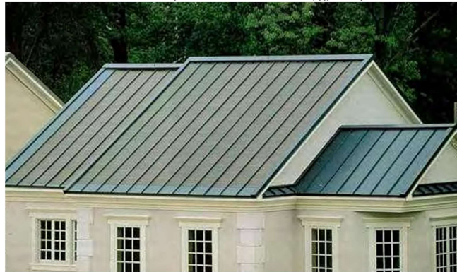
Figure 1. Roof mounted solar PV panels

After the calculation, the value of the Kred is 0,65.