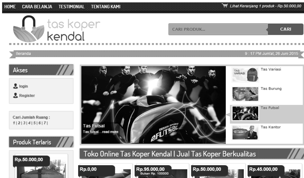
Figure 5. Access Login Control

Login access facility shown in Figure 5 below is the application of access security to database and customer applications as well as administrators. In addition, there is another security login access i.e in accessing CPanel. CPanel is an access control to determine whether e-commerce statistic function has been able to implement good SEO or not. Here is the user interface (UI) of access login.